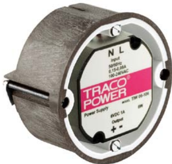
(Mounted in standard flush box)

The TIW series is a new range of small size DC-power supplies which have been designed particularly for applications in home and office installations.